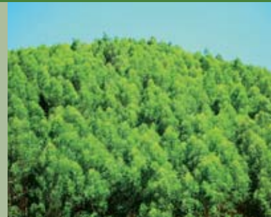
Renewable eucalyptus plantations grown in Brazil for the leading global producer of bleached eucalyptus pulp